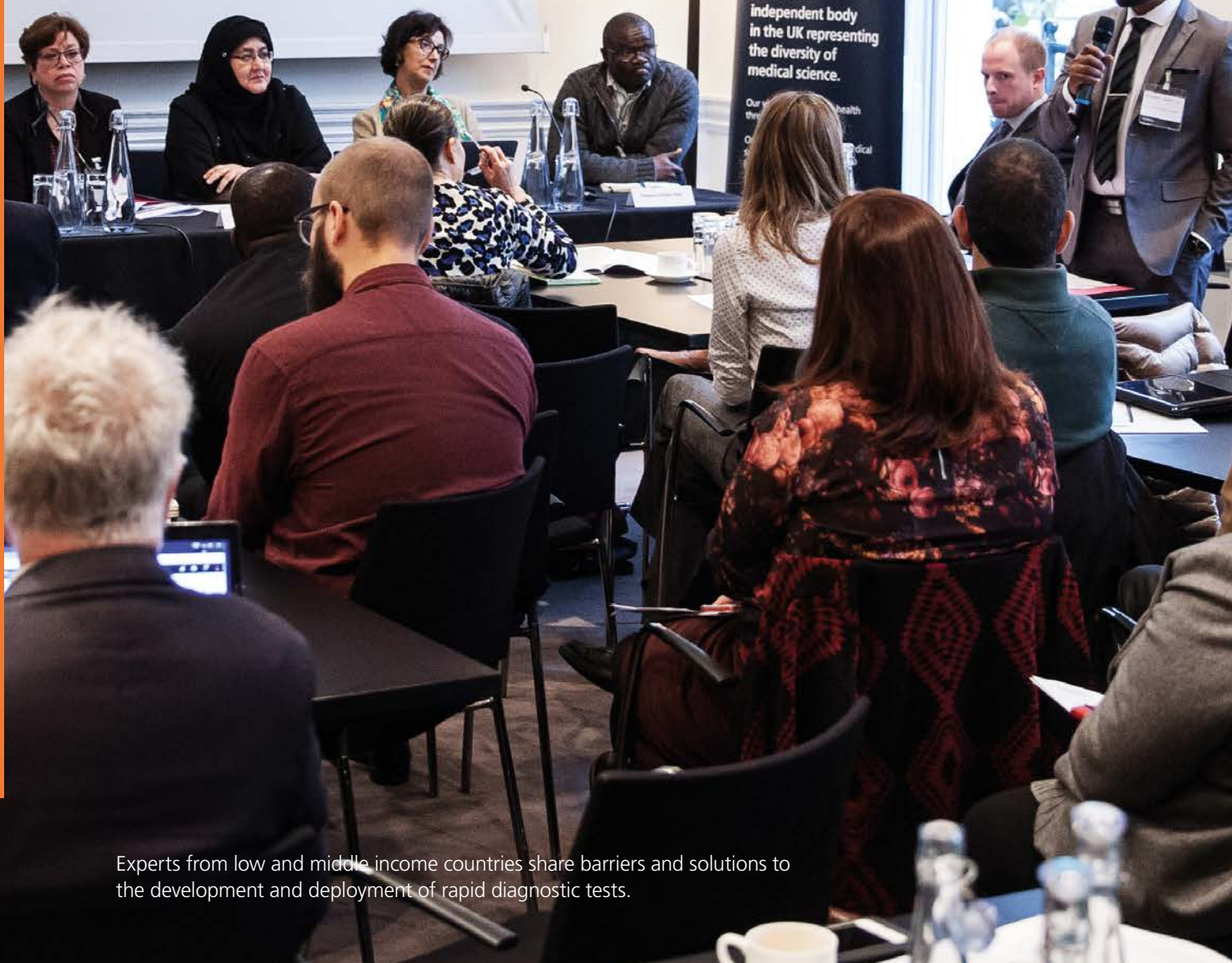
Experts from low and middle income countries share barriers and solutions to the development and deployment of rapid diagnostic tests.

The Academy of Medical Sciences Academy of Medical Sciences We are the independent body in the UK representing the diversity of medical science. Our vision is to improve health through the advancement of medical science.