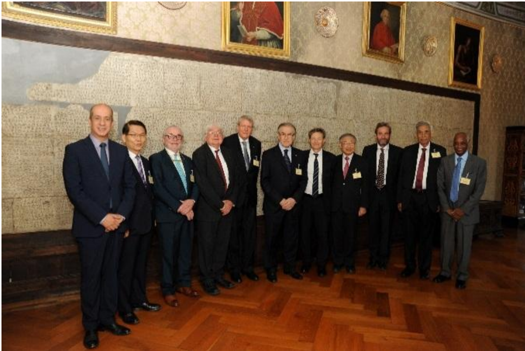
Presidents of the G7 Academies of Sciences and of Networks of Academies at the Lincei Academy of Sciences, Rome, Italy

Two Italian ministers, the Minister of Economy and Finance, Mr. Carlo PADOAN, and the Minister of Culture and Heritage, Mr. Dario FRANCESCHINI, gave speeches at the Conference. During the Dinner organized at the Lincei Academy of Science, the former Prime Minister of Italy, Mr. Romano PRODI, gave a speech about the challenges of constructing a Euro-Mediterranean region of peace and shared prosperity.