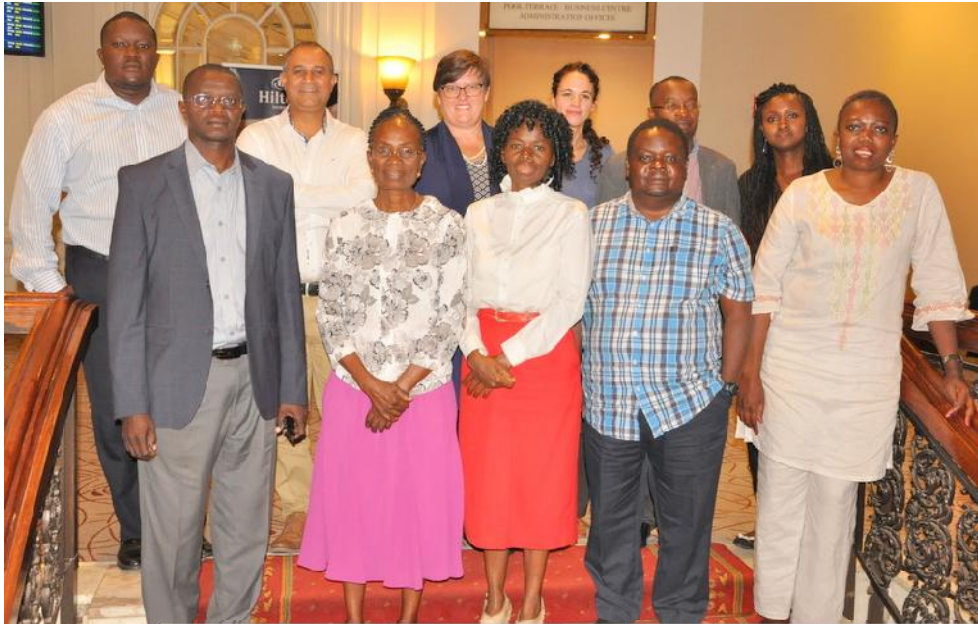
Group photo of the FNSA Editorial team members