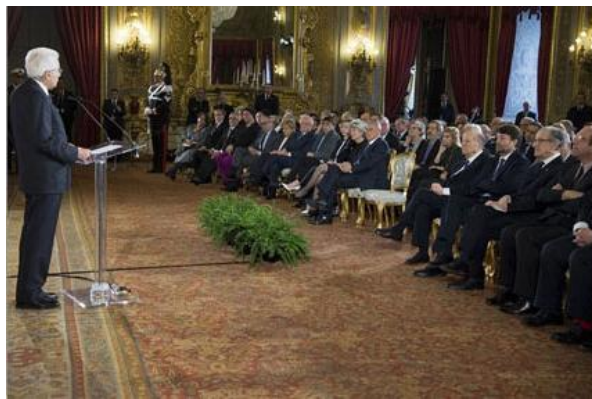
The President of the Italian Republic, His Excellency Sergio MATTARELLA

The participants also had the privilege of being hosted at the Presidential Palace by Italian President, His Excellency Sergio MATTARELLA.