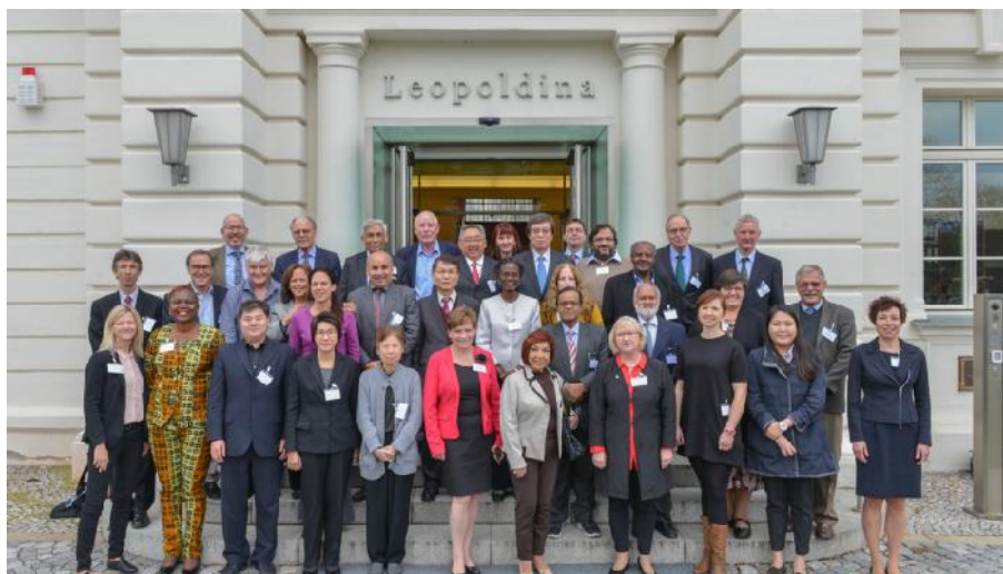
Group Photo of participants at the IAP project meeting on “Food and Nutrition Security and Agriculture”