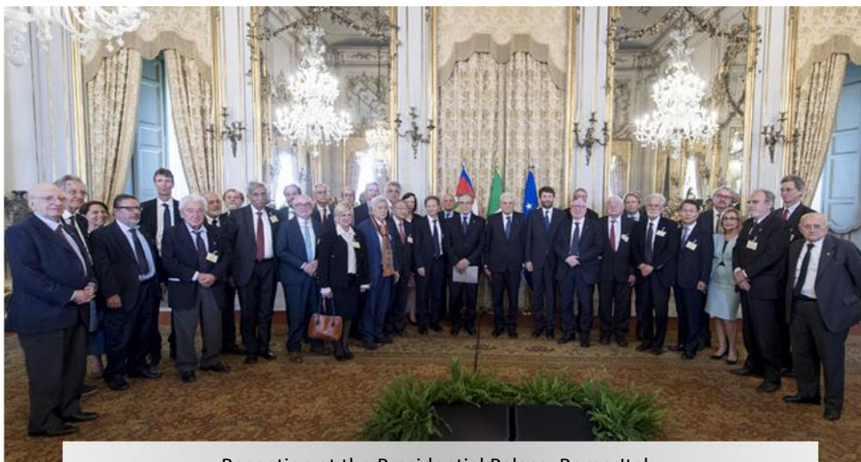
Reception at the Presidential Palace, Rome-Italy

Two Italian ministers, the Minister of Economy and Finance, Mr. Carlo PADOAN, and the Minister of Culture and Heritage, Mr. Dario FRANCESCHINI, gave speeches at the Conference. During the Dinner organized at the Lincei Academy of Science, the former Prime Minister of Italy, Mr. Romano PRODI, gave a speech about the challenges of constructing a Euro-Mediterranean region of peace and shared prosperity.