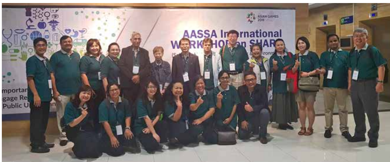
Participants at the AASSA-Indonesian Academy of Sciences (AIPI) workshop on 'SHARE Communication: The importance of media to engage research and development with public understanding', Jakarta, Indonesia.

The Association of Academies and Societies of Sciences in Asia (AASSA), with the support and leadership of IAP, has been actively working to enhance collaboration and cooperation among academies, societies and scientists in Asia and Australasia. It is hosted by the Korean Academy of Science and Technology.