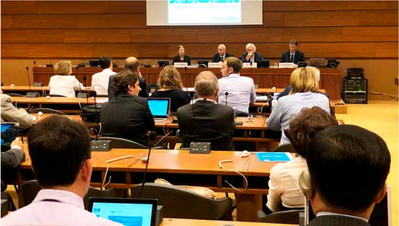
The IAP–US NASEM side event on 'Assessing Security and Governance Issues of Modern Biotechnology: Updates from Academies of Science' at the Meetings of Experts of the Biological Weapons Convention in Geneva, Switzerland, in August.

Parts of the sphere may perhaps contract when issues of concern arise, but can expand once trust is gained, and that continued public engagement by the scientific community is therefore crucial to maintain a balance and for scientists to have an ongoing understanding of their responsibilities.