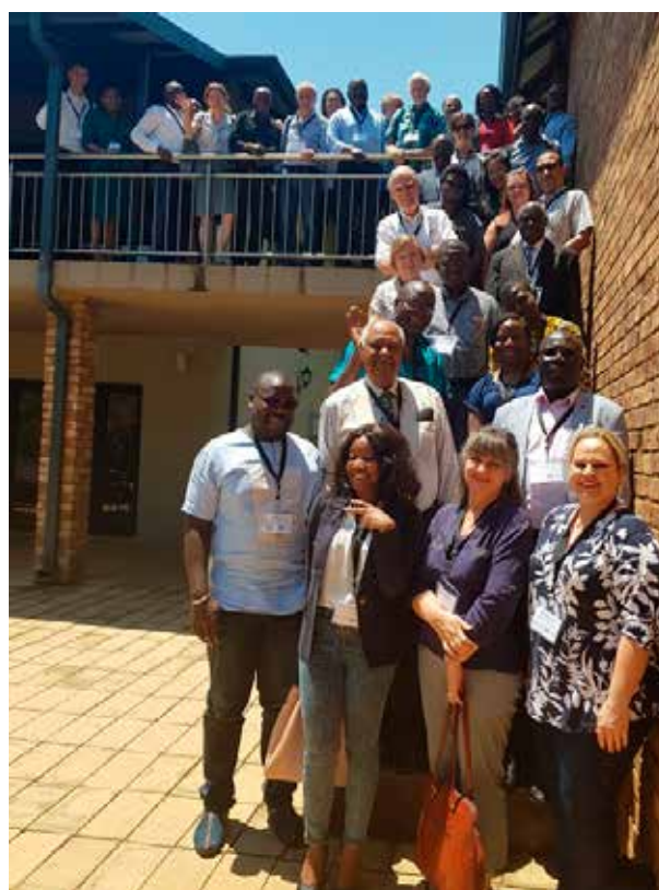
Participants at the first 'Neonicotinoids and their Impact on Ecosystem Services for Agriculture and Biodiversity in Africa' workshop, Pretoria, South Africa.

A new project was also launched. Based on the 2015 EASAC report, 'Ecosystem Services, Agriculture and Neonicotinoids', which reviewed the effects of this class of insecticides on pollinators and other non-target insects, funding has been secured from the German Federal Ministry of Education and Research (BMBF) to undertake a review of the implications of the use of neonicotinoids in Africa. The first workshop was held in Pretoria, South Africa, in November 2018, hosted by the Academy of Science of South Africa (ASSAf). The project will conclude with the release of a report with recommendations for policymakers.