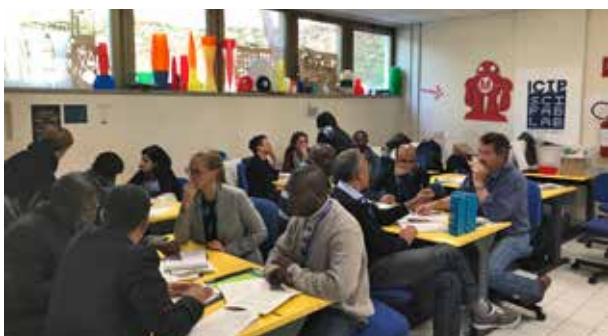
Participants at the 'Inquiry-Based Science Education, an introduction' training workshop held at ICTP in Trieste, Italy.

A major outcome of the third Africa-Mediterranean-European Academies for Science Education conference (AMEASE III) held in Paris in October 2017 was an agreement to work towards establishing 'Centres for Education in Science in the Africa-Mediterranean-European' region (CESAME). At the time, proposals were received from six African countries (Benin, Cameroon, Egypt, Morocco, South Africa and Tunisia) as well as from the Abdus Salam International Centre for Theoretical Physics (ICTP), Italy.