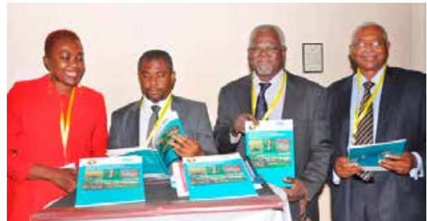
The launch of the NASAC-Food and Nutrition Security and Agriculture (FNSA) Report.

Shortly after, on 19-20 September, NASAC participated in the IAP-Carnegie project's Africa workshop on 'Improving scientific input to global policymaking, with a focus on the UN Sustainable Development Goals' (see pages 18-19), an event organised in Nairobi, Kenya, to help academies better understand the SDGs and work towards achieving them. The event was attended by delegations from academies from 16 different countries: Benin, Botswana, Cameroon, Cot d'Ivoire, Ethiopia, Ghana, Kenya, Mauritius, Morocco, Nigeria, Senegal, South Africa, Sudan, Tanzania, Uganda, and Zambia.