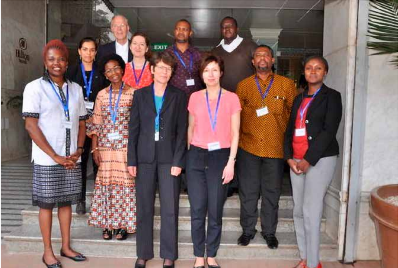
Participants at the NASAC-German National Academy of Sciences, Leopoldina evaluation meeting, Halle, Germany.

Education Commission of Pakistan, the Pakistan Academy of Sciences and the InterAcademy Partnership Science Education Programme (IAP SEP – see pages 16-17). The forum provided a platform to discuss ways of supporting science while making sure it meets society's expectations.