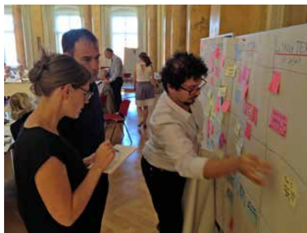
Young academy participants of the EASAC regional SDGs workshop capture ideas for ways to support the implementation of the SDGs, hosted by the German Academy of Sciences, Leopoldina, September 2018.

The project was also represented at a number of international science meetings including the Next Einstein Forum Global