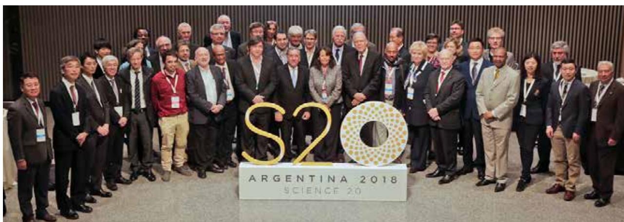
Representatives of IAP and its regional networks engaged in the Food and Nutrition Security and Agriculture (FNSA) project at the meeting of the S20 academies in Rosario, Argentina.

IANAS is a network of 21 academies of science and three scientific organizations. Its mission is to strengthen science communities in the Americas through capacity building and to provide an independent source of science policy advice to governments and the public on key challenges for the future of the region. IANAS is hosted by the Mexican Academy of Sciences.