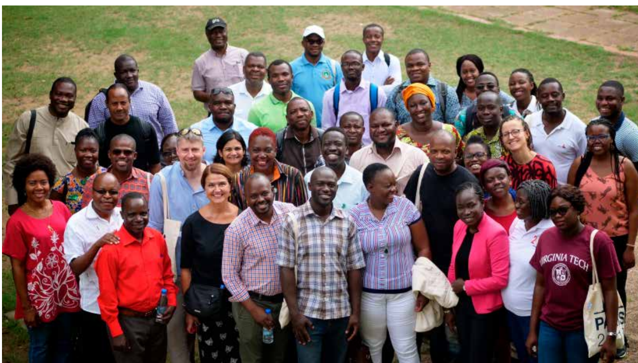
Participants at the Leading Integrated Research for Agenda (LIRA) Scientific Advisory Committee (SAC) meeting, Lilongwe, Malawi.

The Network of African Science Academies (NASAC) is a consortium of 24 merit-based science academies in Africa and aspires to make the voice of science heard by policy and decision makers in the continent and worldwide. NASAC is dedicated to enhancing the capacity of existing national science academies and facilitating the creation of new academies in countries where none exist.