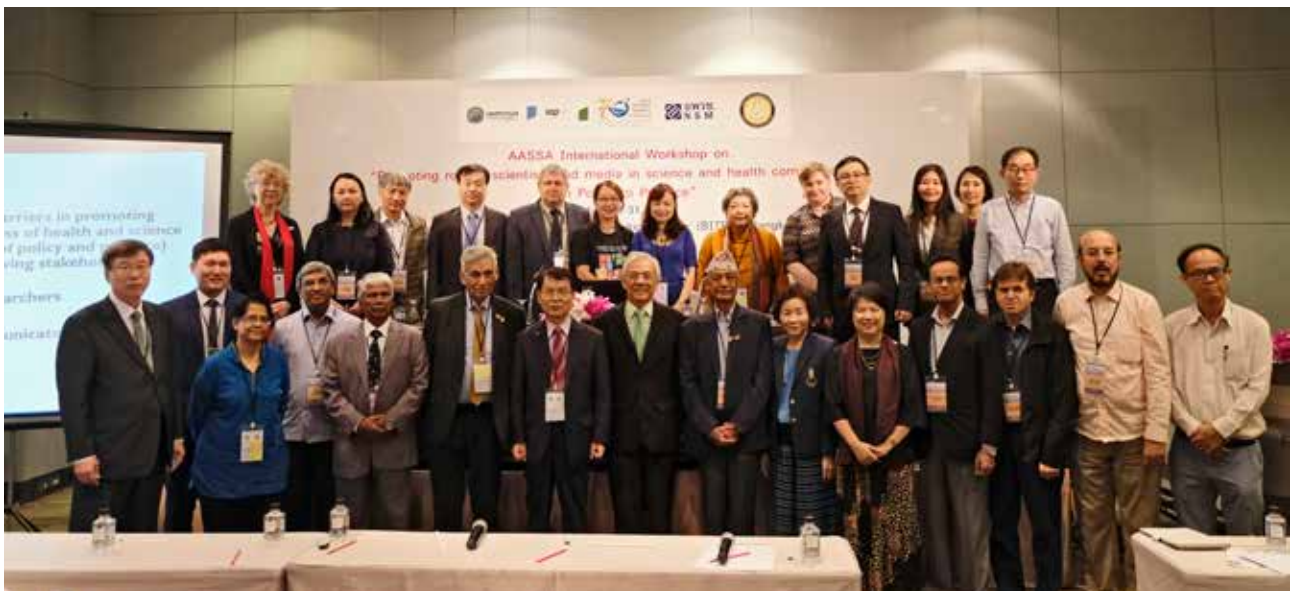
Participants at the AASSA International Workshop on 'Promoting the role of Scientists and Media in Science and Health Communication: From policy to practice', Bangkok, Thailand.

For additional information on AASSA, please visit: www.aassa.asia Twitter: @AassaOnline