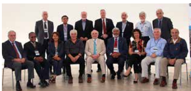
Participants at the IANAS Executive Committee meeting and the IANAS-IAP Sustainable Development Goals workshop, Mexico City, Mexico.

The IANAS executive meeting was hosted by the Mexican Academy of Science in Mexico City on 28-29 May 2018,