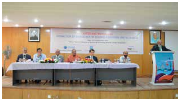
Participants at the AASSA-Bangladesh Academy of Sciences (BAS) Regional Workshop on 'Promotion of Excellence in Science Education and Research', Dhaka, Bangladesh.