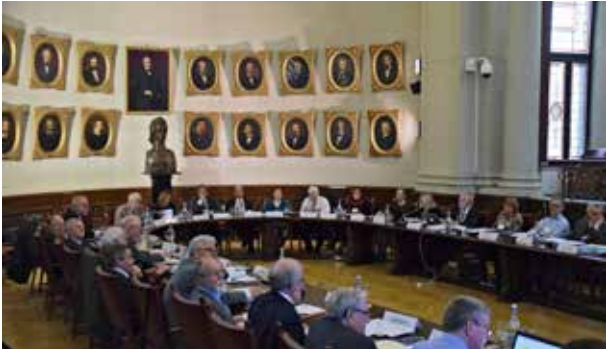
EASAC Council meeting, Bucharest, Romania.

of genome editing: Emerging points from an international workshop' in Frontiers in Bioengineering and Biotechnology (28 March 2018); and 'Addressing decreasing vaccine coverage in the EU' in The Lancet (28 April 2018).