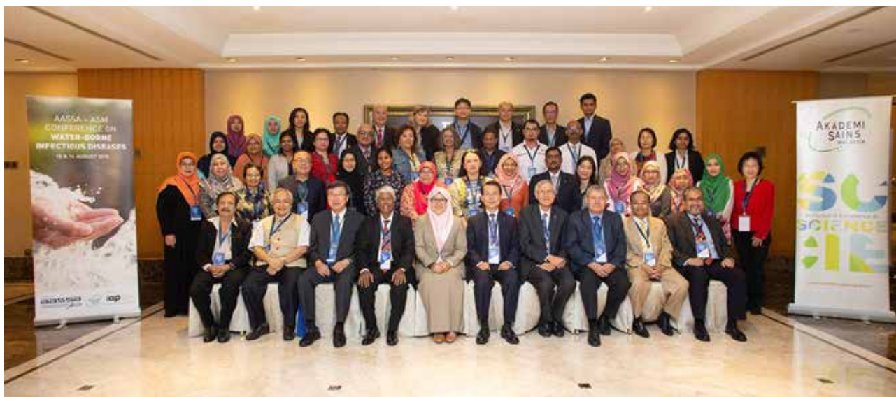
Participants at the AASSA-Malaysian Academy of Sciences (ASM) Regional Workshop on 'Water-Borne Diseases', Kuala Lumpur, Malaysia.