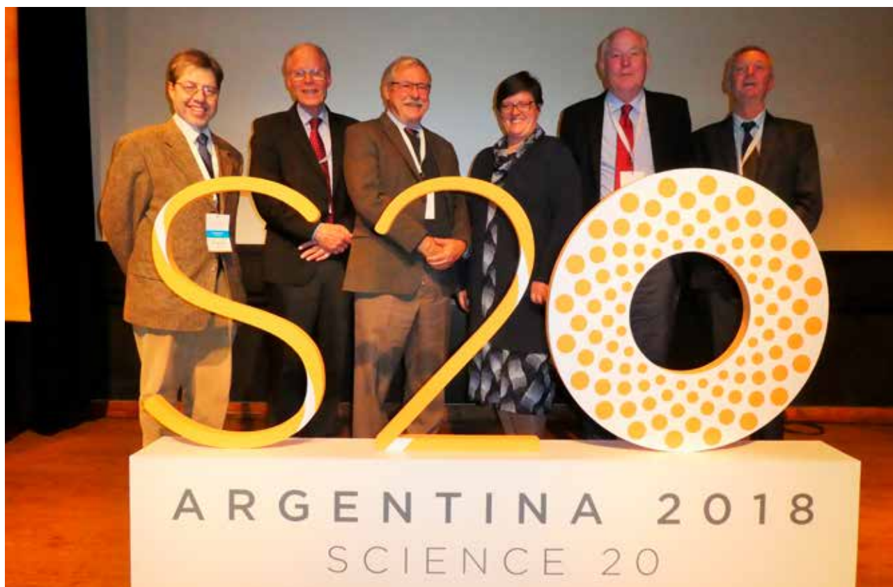
Representatives of the IAP 'Food and Nutrition Security and Agriculture' project at the S20 meeting held in Rosario, Argentina, on 24-25 July 2018.

The IAP Food and Nutrition Security and Agriculture (FNSA) global programme has resulted in the publication of reports from each of the four IAP regional networks of academies along with a final over-arching global synthesis. It is largely funded by the German Federal Ministry of Education and Research (BMBF).