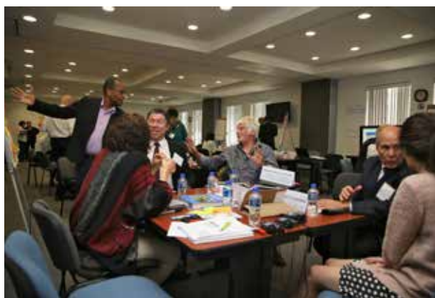
Participants of the IANAS regional SDGs workshop work together to create an SDGs action plan, hosted by the Mexican Academy of Sciences, May 2018.

Launched in August 2016, this project explores opportunities for academies to support more effectively the implementation of the UN Sustainable Development Goals (SDGs), encouraging academies to collaborate with key stakeholders and adopt good practices.