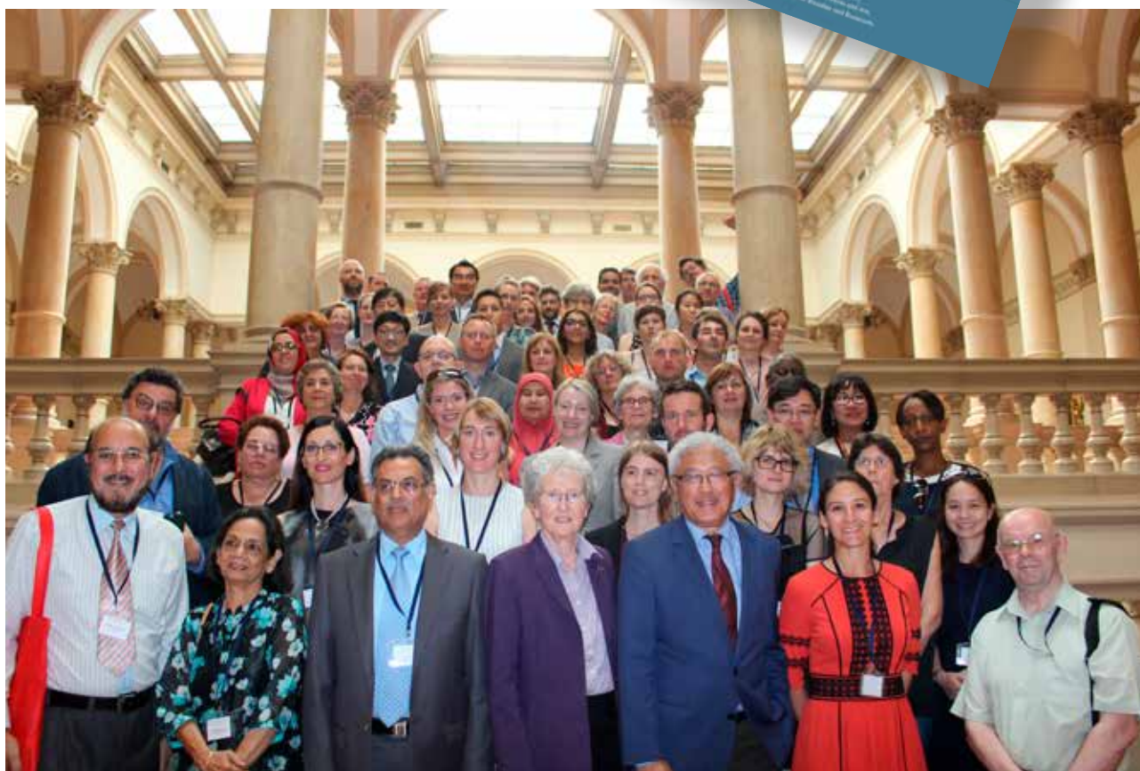
Participants at the workshop on 'Governance of Dual Use Research in the Life Sciences: Advancing global consensus on research oversight', Zagreb, Croatia.