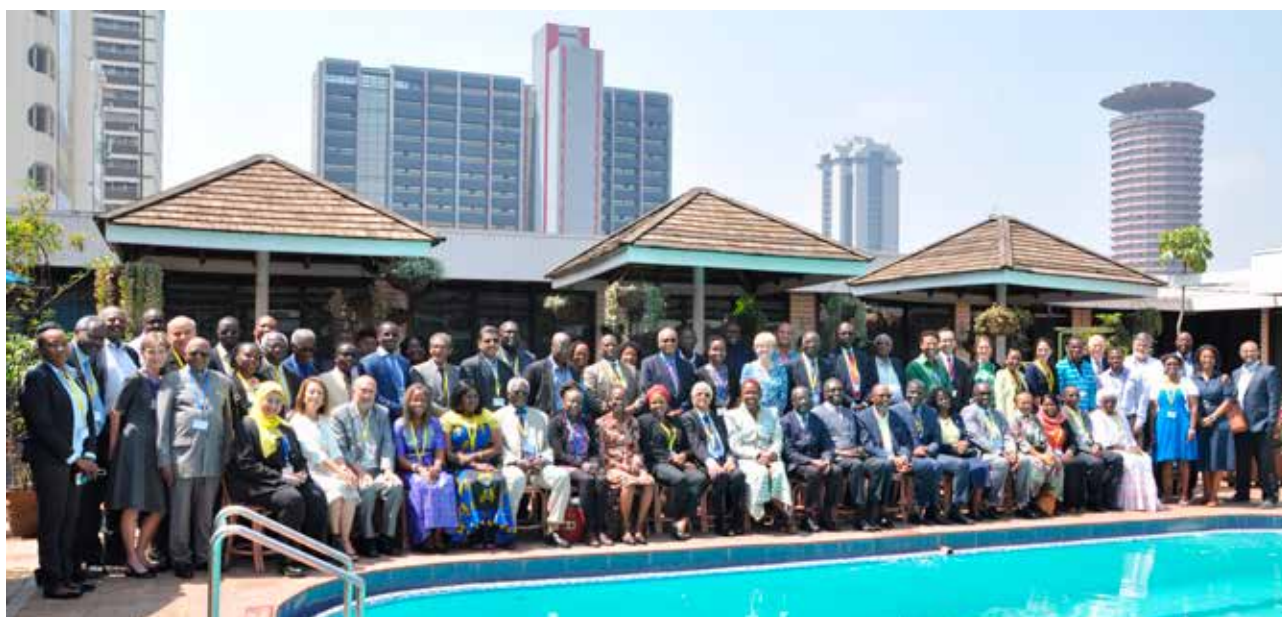
Participants at the NASAC-IAP Policy and German National Academy of Sciences, Leopoldina, workshop, Nairobi, Kenya.