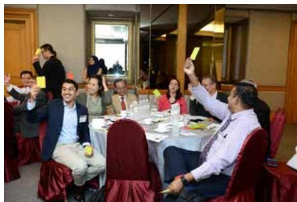
Participants of the AASSA regional SDGs workshop respond to a poll, hosted by the Malaysian Academy of Sciences, August 2018.