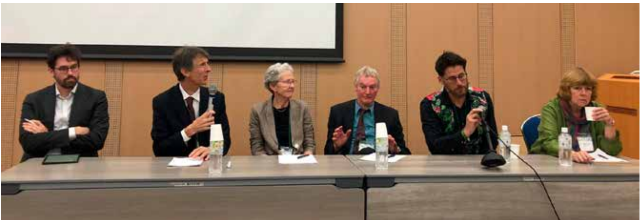
The IAP session on 'Engaging key stakeholders in addressing biosecurity challenges: Insights from the social sciences', at the World Social Sciences Forum (WSSF), Fukuoka, Japan.