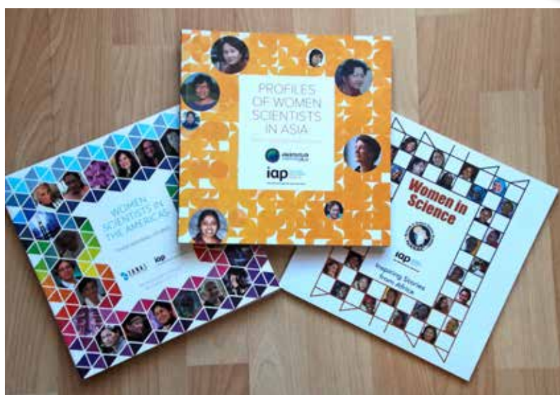
Three publications supported by IAP: 'Women scientists in the Americas', 'Profiles of women scientists in Asia', and 'Women in science: Inspiring stories from Africa'.