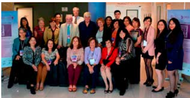
Participants at the annual meeting of the Focal Points of the IANAS Women for Science Programme, Rio de Janeiro, Brazil.

The Women for Science (WfS) Programme focal points held their meeting on 27-30 August 2018 in Rio de Janeiro, Brazil, hosted by the Brazilian Academy of Sciences. They also participated in a symposium where young women scientists from Central and South America spoke about their experiences both as students and young professionals in their respective fields. Several years ago the WfS group established the 'Anneke Levelt Senger Prize' to recognise young women scientists in developing countries, and immediately after the meeting in Rio a call for nominations was sent out for the 2019 competition. In addition, an updated version of the IANAS 2017-2018 'Survey of Women Scientists in the Academies' was published.