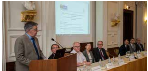
László Lovász, President of the Hungarian Academy of Sciences, at the EASAC Joint Meeting of the Energy and Environment Steering Panels, Budapest, Hungary.

EASAC member academies are deeply engaged in EASAC's work in a number of ways. Crucially, European national science academies nominate their experts to serve on EASAC's working groups and steering panels, covering also all their travel expenses (experts give their time for free). Furthermore, members often organise meetings of working groups and steering panels at their own academy, which sometimes requires substantial logistical support and as