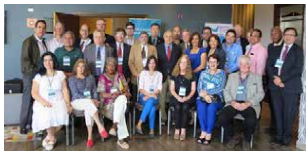
Representatives of the IANAS Water Programme at the World Water Forum, Rio de Janeiro, Brazil.

Members of the IANAS Water Programme participated in four international water fora: the first was in Ipatinga, Brazil (19-20 February 2018) where the topic was 'Quality of Water: Present situation, problems and solutions in the different countries of the Americas'. At the World Water Forum in Rio