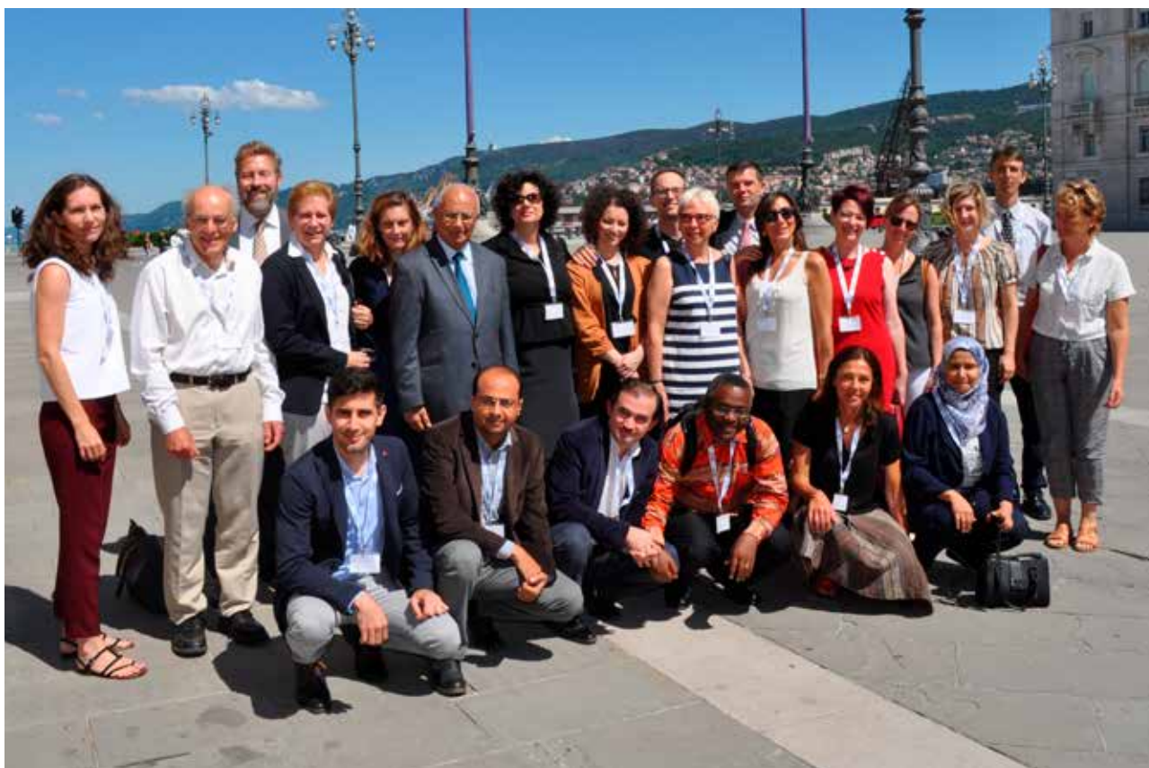
Participants at the First Science International Working Group meeting on Refugee and Displaced Scientists, Trieste, Italy.

IAP supports its four regional networks, the Association of Academies and Societies of Sciences in Asia (AASSA, Asia/Pacific); the European Academies' Science Advisory Council (EASAC, Europe); the InterAmerican Network of Academies