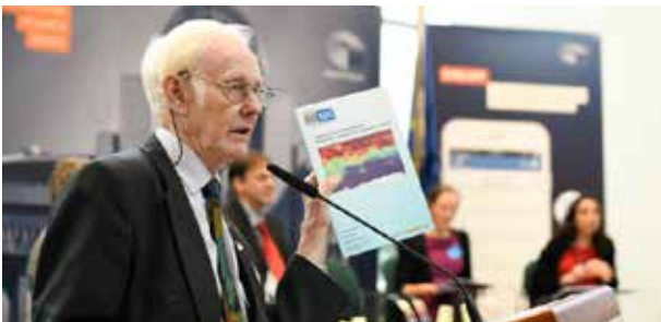
Presentation of the EASAC report 'Negative emission technologies: What role in meeting Paris Agreement targets?', Brussels, Belgium.

Press coverage of EASAC's publications was extensive in 2018. EASAC reports were picked up and commented on by a wide range of leading international and European titles, such as: the BBC, New York Times, Huffington Post, EurActiv, Le Figaro , Le Monde , L'Obs , The Times , The Guardian , The