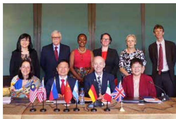
The IAP Health Executive Committee met in Manila, hosted by the National Academy of Science and Technology, Philippines (NAST PHL).