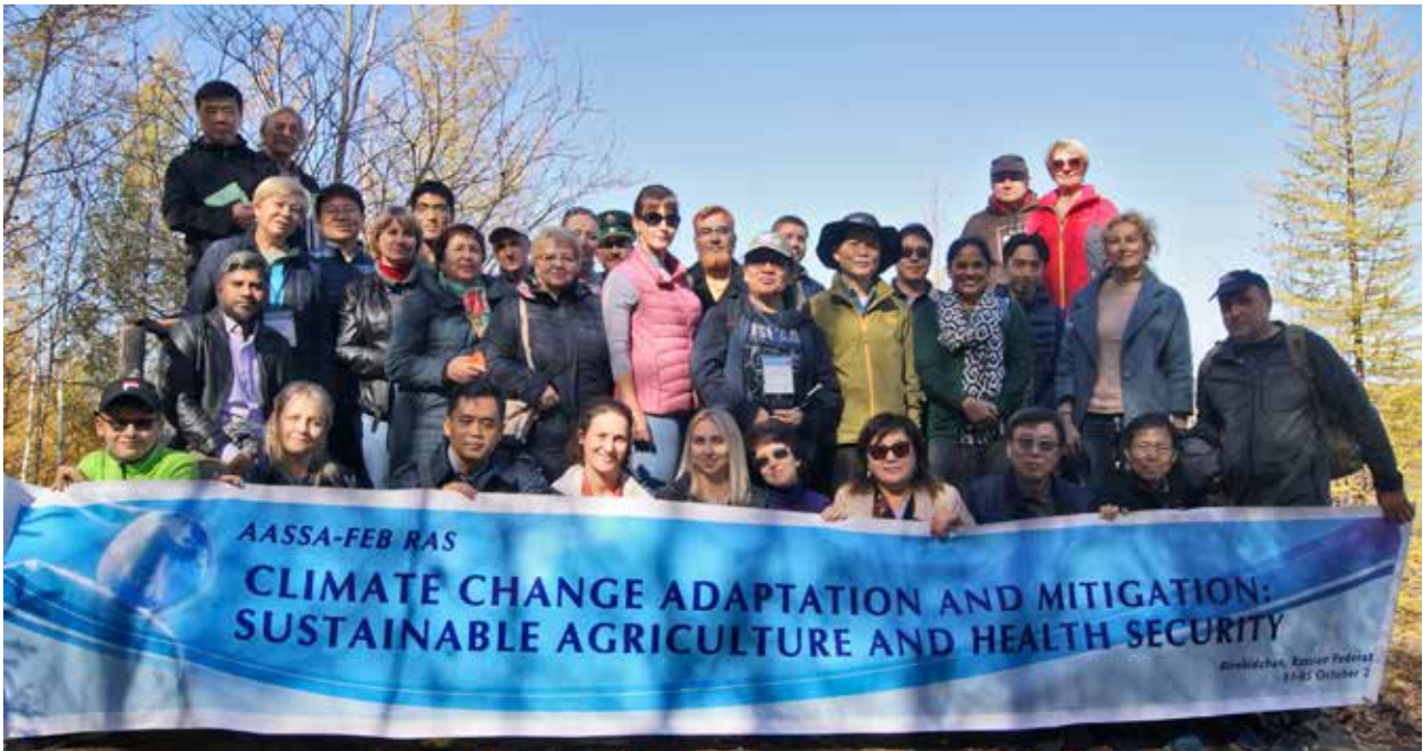
Participants at the AASSA-Far Eastern Branch of the Russian Academy of Sciences (FEB RAS) international workshop on 'Climate Change Adaptation and Mitigation: Sustainable agriculture and health security', Birobidzhan, Russian Federation.