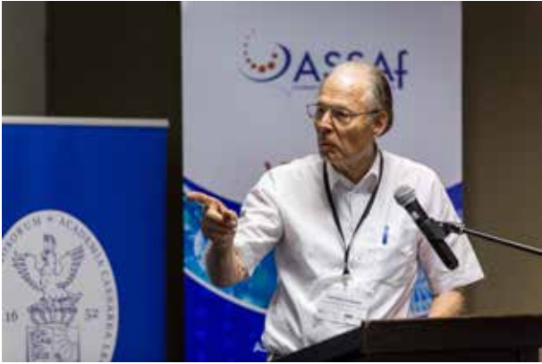
IAP President Volker ter Meulen.

of Sciences (IANAS, the Americas); and the Network of African Science Academies (NASAC, Africa). The networks help build the capacities of smaller and newer national academies. This is vitally important since policy formulation, implementation and review typically occur at the national level. The joint IAP meeting, hosted in September 2018 by the Swiss Academies of Arts and Sciences in Bern, Switzerland, recommended the Academia Nacional de Ciencias, Cordoba, Argentina , and the Global Young Academy (GYA – see pages 22-23) to the IAP General Assembly for election as IAP members. Furthermore, an IAP grant resulted in the establishment of the Kingdom of Eswatini Academy of Sciences (KEAS) on 27 November (see page 39).